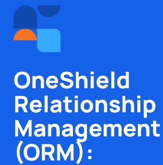
OneShield Relationship Management (ORM):

An add-on to OneShield Designer, Package Designer, provides the ability to wrap together disparate coverages and coverage parts, including those traditionally defined as commercial and personal lines, into a single policy package. Use already-configured Products and Coverages to create a Package Policy without having to reconstruct those elements. Customize product offerings to address customer demand and service new markets.